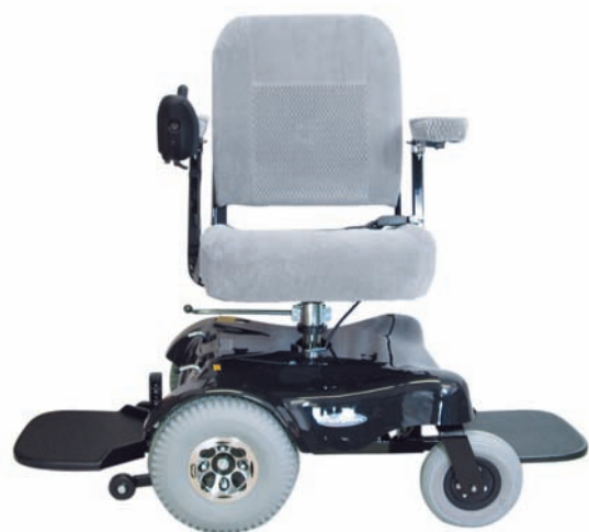
Convertible with Dual Footplates Height, Length & Angle adjustable

The PaceSaver Scout MI power base helps you enjoy an exciting, invigorating pace. Enabling you to spend more time doing things that you enjoy with family and friends. The American made MI Convertible ™ is the most advanced power base of its kind.