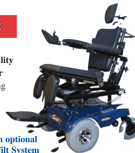
Shown with optional Equalizer Tilt System